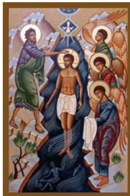
Baptism of The Lord.